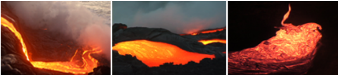
“Lava - Kilauea, Hawaii” Video and Photos - Gillerman © 2016